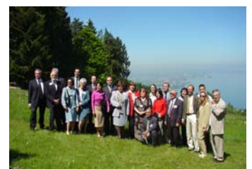
Conference Participants, May 2002

Efforts are currently underway to realize these objectives.