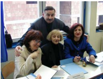
Teachers from Banja Luka and Nova Bila Primary Schools

The EFP Certificate is a two-year program focussed on intensive