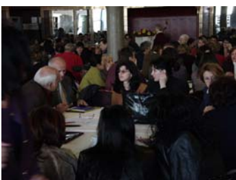
Participants discussing at the "Culture of Healing" Seminar in Tuzla

The primary purpose of the training was to familiarise the participants with the concepts underlying a "Culture of Healing" and how such a culture and new outlook on life can be nurtured and take hold.