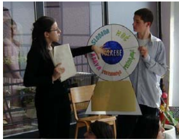
Regional Peace Event, May 2001 Sarajevo