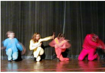
National Peace Event, February 2001 Banja Luka