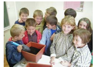
Primary school students, October 2000 Nova Bila

The EFP program has since gained the dedicated support of the BiH Ministry of Foreign Affairs and international governments, and will be extended across the country in two phases. See article "EFP-World..." on p.1 for more details about expansion in BiH.